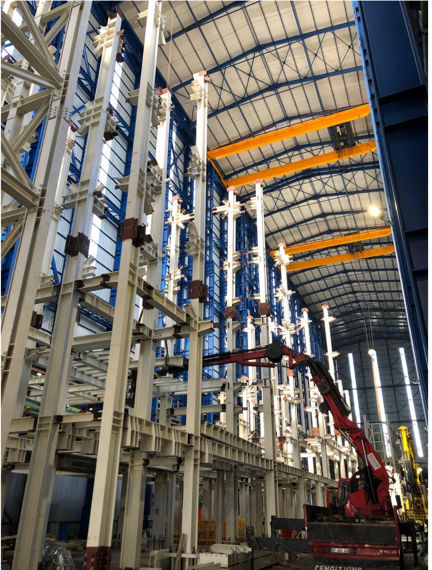
TAT METAL Continuous Galvanizing Line 3 ( 5500 ton) 2023-2024

Manufacturing and Assembly+ Piping + Mechanical Equipment Assembly