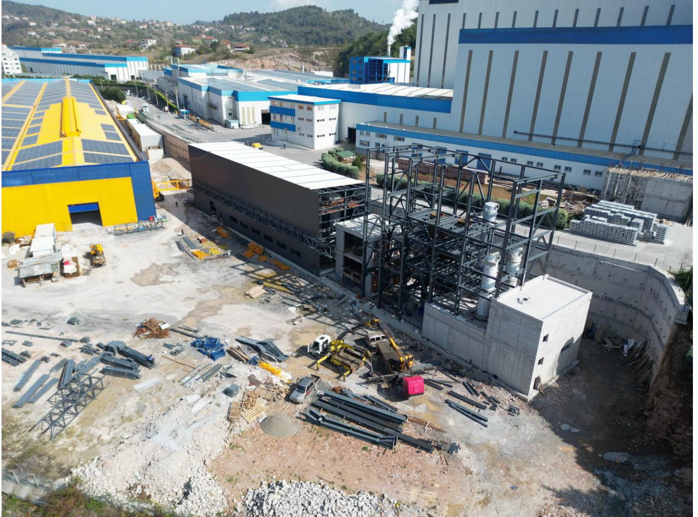
ÇINARBORU-SMS ARP Line ( 650 ton) 2023-2024

Steel,Piping and mechanical Equipment Assembly