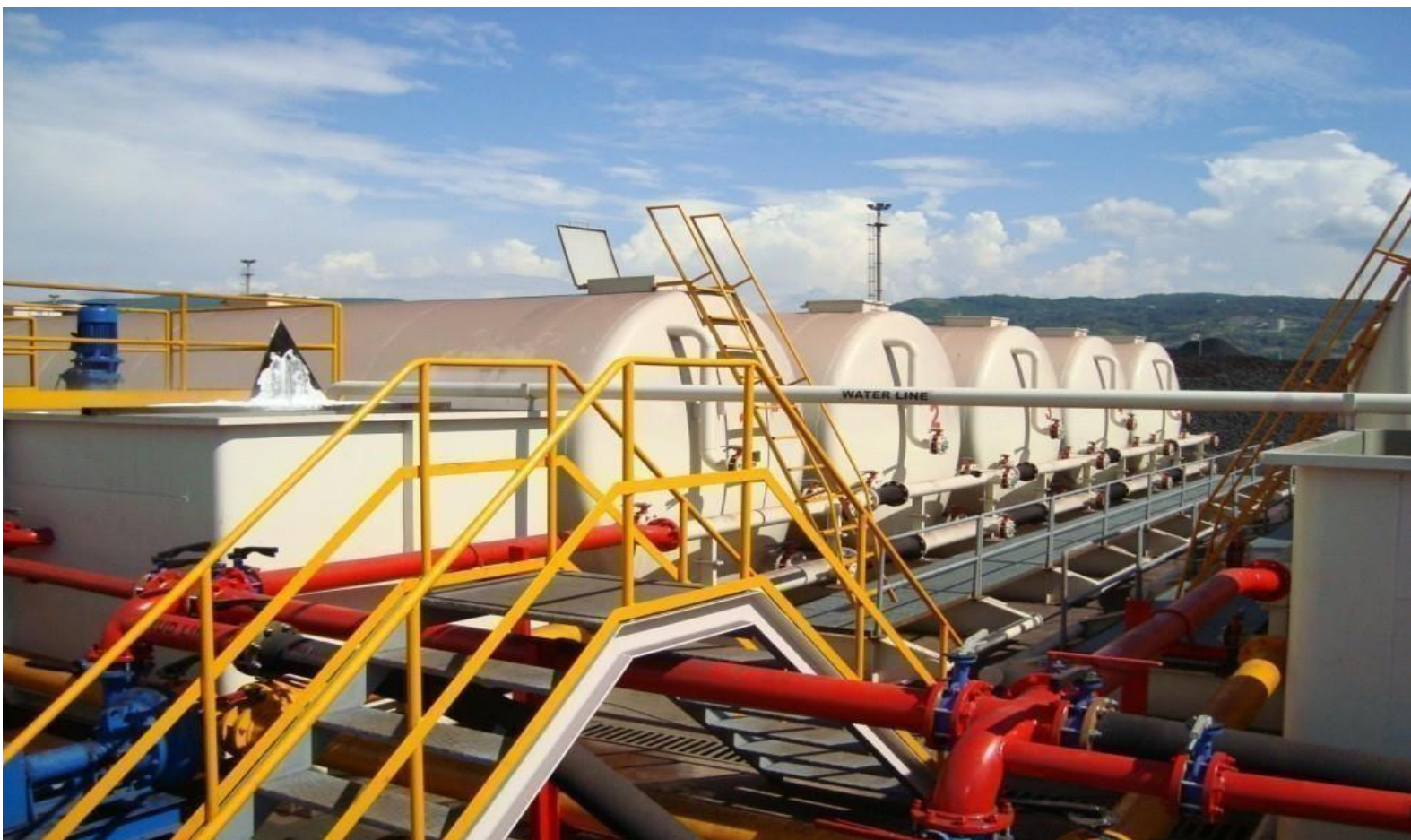
TPAO Mud Plant - 2011 Steel Construction Manufacturing and Assembly + Piping