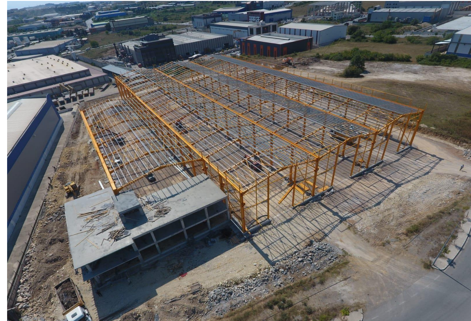
ÇINARBORU A.Ş HANGAR -2020 ( 500 ton)