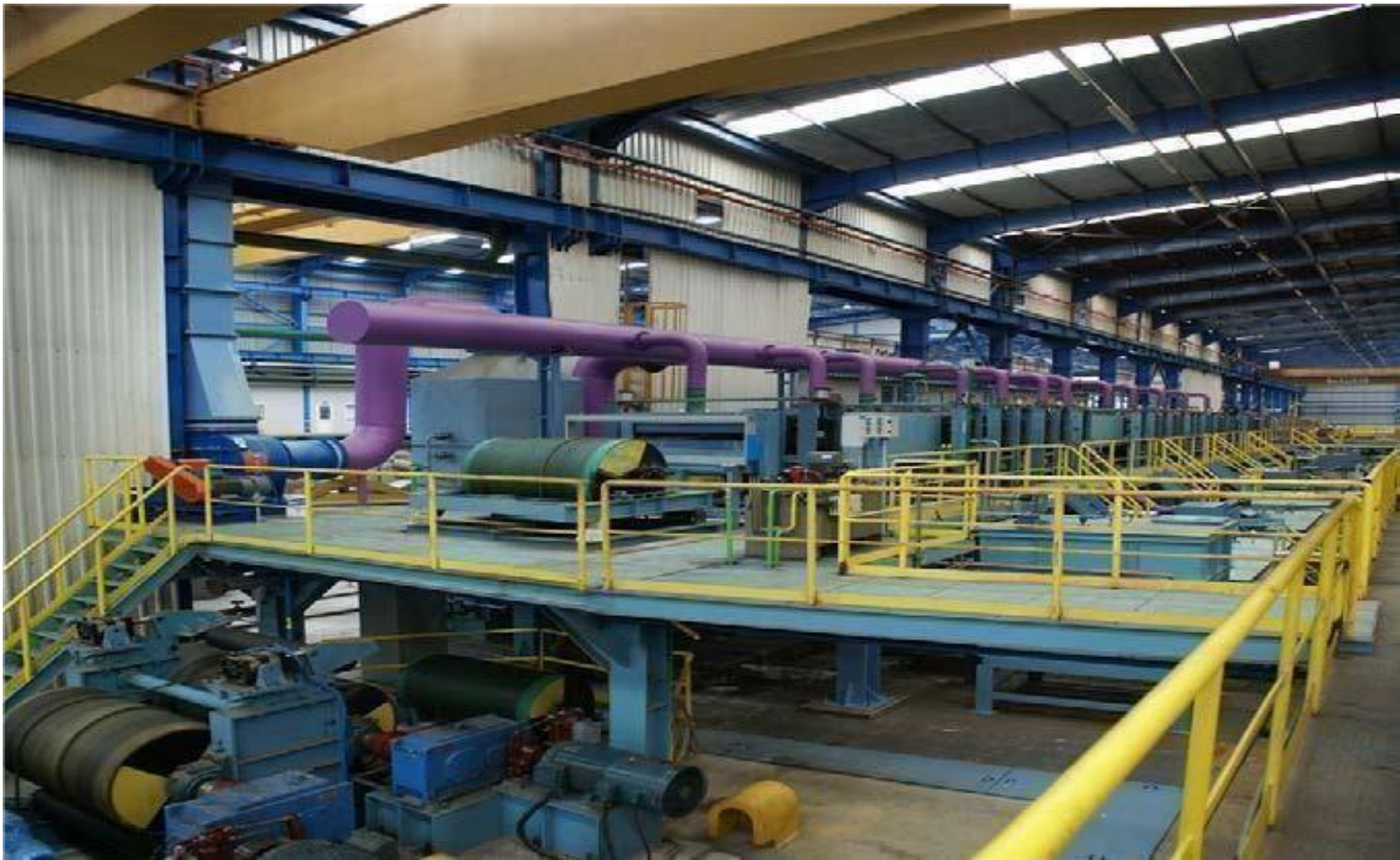
TAT METAL Pickling Line 1 - 2006 Steel Construction Manufacturing and Assembly