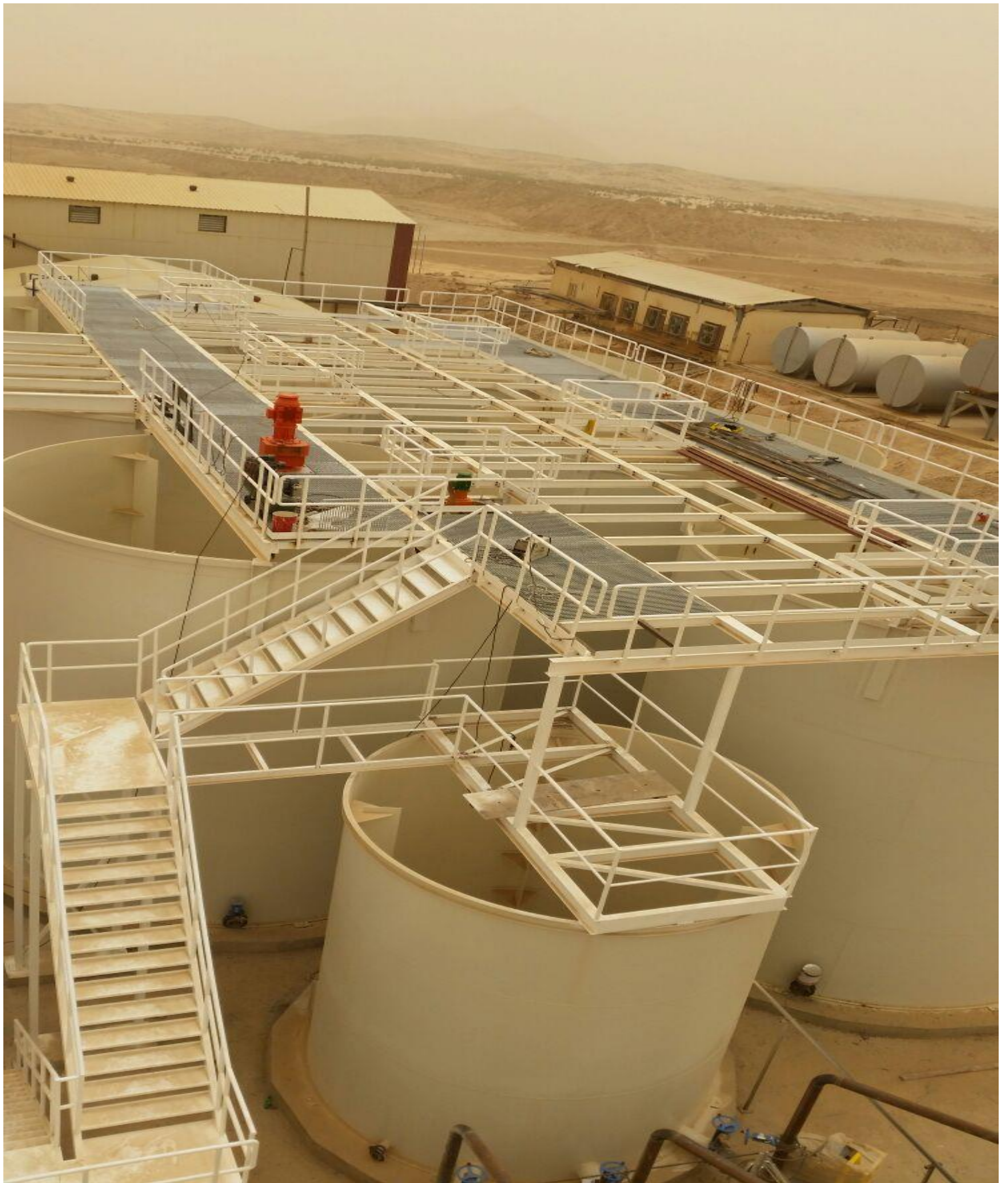
DELGO MINING LTD. / SUDAN -2016 Tank Manufacturing and Assembly+ Piping