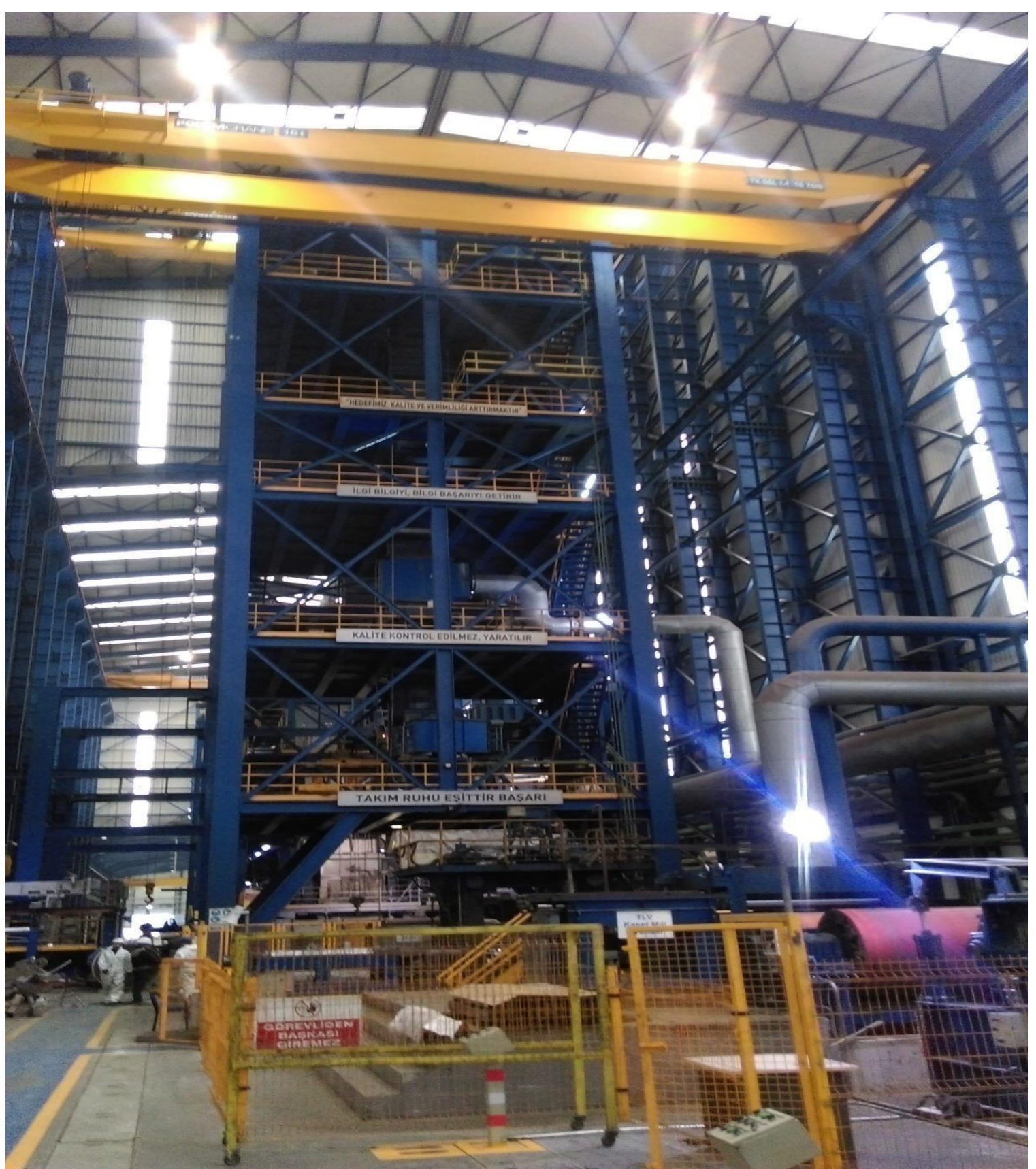
TAT METAL Continuous Galvanizing Line 1 2009 Steel Construction Manufacturing and Assembly + mechanical equipment assembly+ Piping